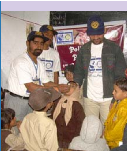
Rotaractors in Nawabshah and other members of the Rotary family are in the forefront of Pakistan's push to eradicate polio.

Rotarians and other members of the family of Rotary teamed up with government agencies and businesses to support the NIDs in several ways. Rotarians organized a conference for Pakistan's Muslim leaders, who declared their full support for polio eradication. Announcements were made in all mosques and Islamic schools, urging that every child be immunized. Rotary and Coca-Cola Pakistan joined in promoting polio immunization on 20 prominent billboards across the country. Waqas Advertisers provided an additional 20 billboards in Karachi. And more than 100 journalists were given background training on health issues in the Federally Administered Tribal Areas to encourage coverage of these topics, especially polio.