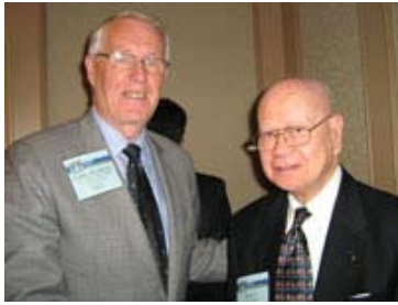
Past RI presidents Carl-Wilhelm Stenhammar and M.A.T. Caparas were among the attendees at the 2007 Council on Legislation in Chicago.

CHICAGO — Rotary's parliament determined to hold fast with Rotary's commitment to eradicating polio in its second full day of voting at the 2007 Council on Legislation in Chicago, where representatives from 530 Rotary districts around the world gathered to discuss and vote on more than 300 items that affect all Rotary clubs.