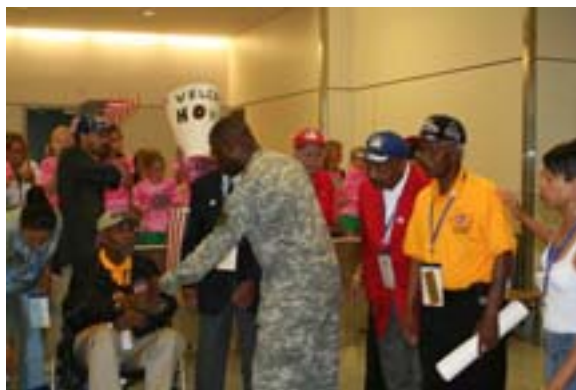
The legendary Tuskegee Airmen made a special appearance to greet returning troops. Click here to learn more about the Tuskegee Airmen

The DFW management, American Airlines, the USO, VFW, and volunteers of many organizations coordinated by the North Texas Commission were singled out for particular praise. It is truly an emotional and uplifting experience for the troops and for those who attend the welcome home.