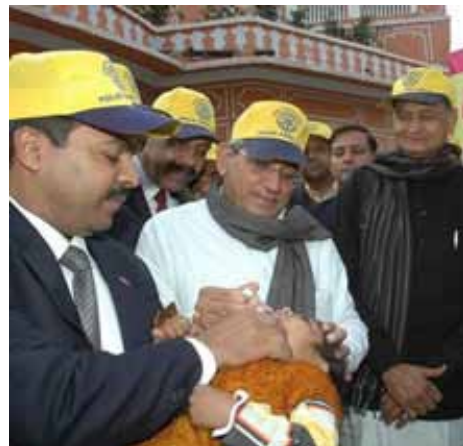
Rotarians and state government leaders in Jaipur, Rajasthan, India, vaccinate children against polio during a National Immunization Day in 2011.