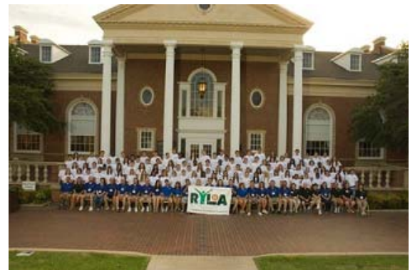
2008 RYLA participants

Click here to see a map of TWU's Main Campus. Remember to park in the Blagg-Huey Library parking lot!