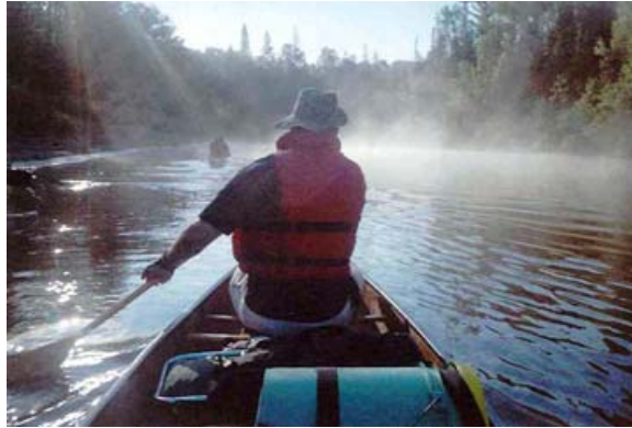
International Fellowship of Canoeing Rotarians The friendships that come from canoeing down a choppy river adds a wonderful dimension to the service and fellowship of Rotary.

There are more than 80 Rotary Fellowships. They're just one more way Rotarians are promoting international fellowship, friendship, and service. To see a complete list of Rotary Fellowships, go to Global Networking Groups database .