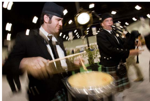
Plenty of live entertainment and excitement are on hand at the House of Friendship, the social hub of the RI Convention.