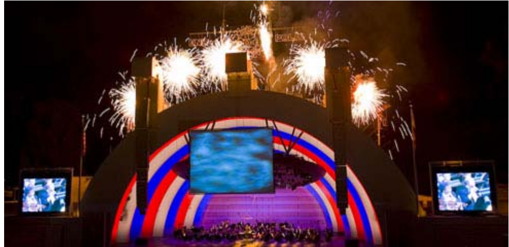
The 99th annual Rotary International Convention was held in Los Angeles from 15 to 18 June.

Literacy, health, and the future of Rotary were in the spotlight 18 June at the fourth plenary session of the RI Convention in Los Angeles.