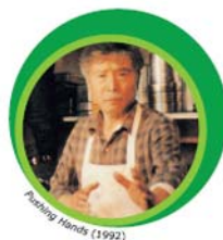
Pushing Hands (1992)