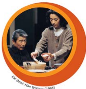
Eat Drink Man Woman (1994)

Saturday, November 21, 2009 "Eat Drink Man Woman" (1994): 7 p.m. Lyceum, University Union Panel Discussion Follows