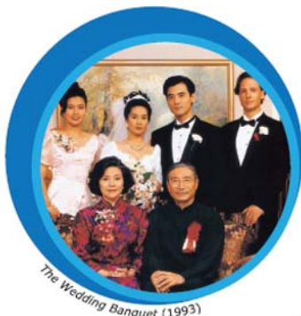
The Wedding Banquet (1993)