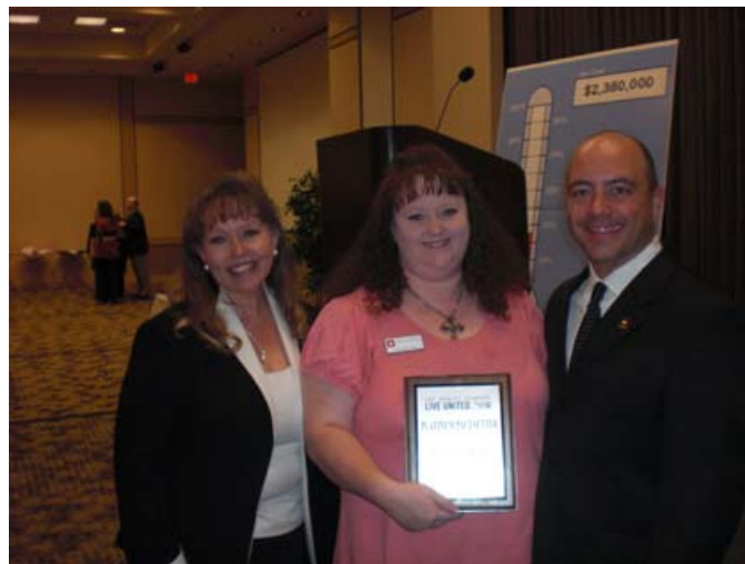
NorthStar Bank receives Platinum Pacesetter Award.