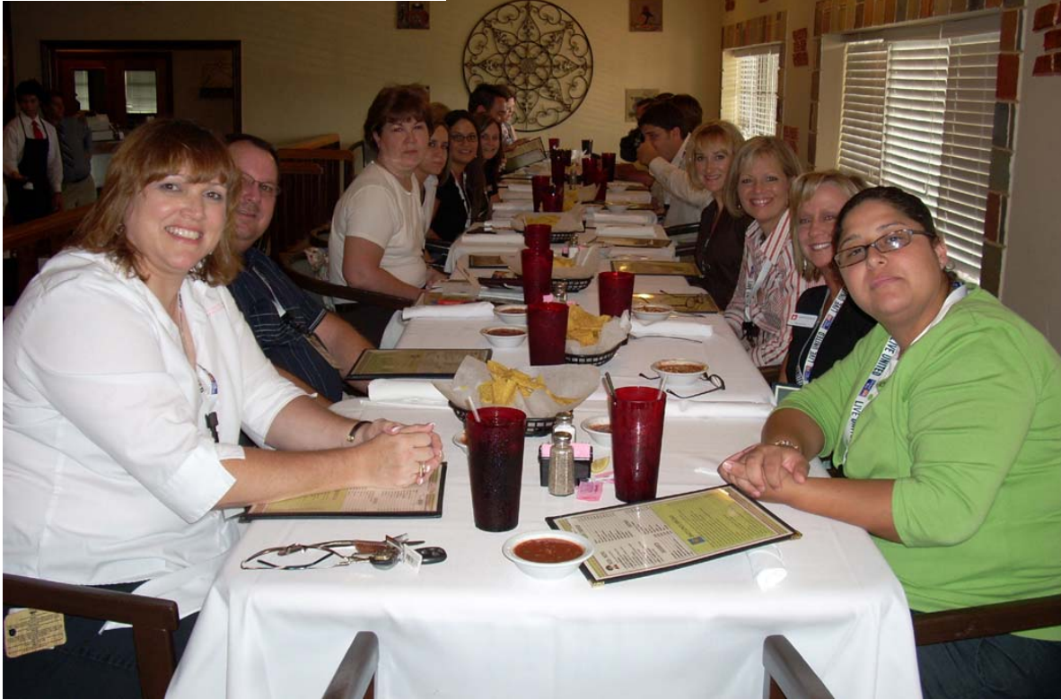
United Way's Leaders on Loan celebrated the kickoff of the 2008 United Way campaign last week.

GIVE. ADVOCATE. VOLUNTEER. LIVE UNITED ™ United Way