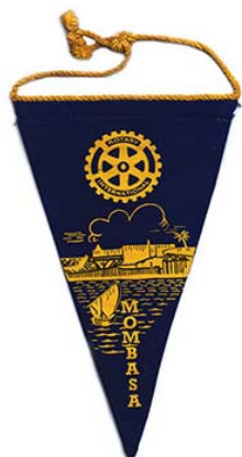
Rotary Club of Mombasa, Kenya