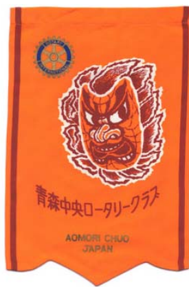
Rotary Club of Aomori Chuo, Aomori, Japan