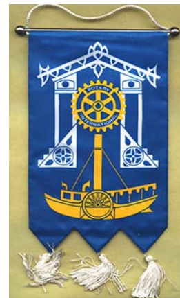
Rotary Club of Turku-Samppalinna, Finland