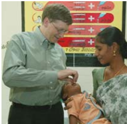
Bill Gates administering polio vaccine

Most of the initial $100 million will be spent in support of mass immunization campaigns in polio-affected countries, poliovirus surveillance activities, and community education and outreach. The grant will also support an expanded research agenda on ways to expedite interruption of the transmission of the wild poliovirus. Rotary will distribute the funds through grants to WHO and UNICEF.