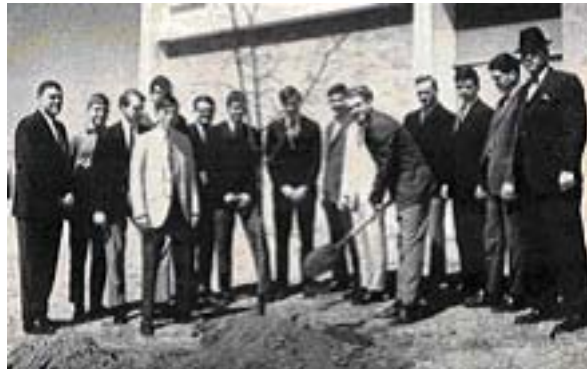
In March 1968, the Rotaract Club of University of North Carolina-Charlotte, USA, planted a tree on its campus to commemorate receiving the first Rotaract charter

Learn more about World Rotaract Week , observed this year 10-16 March. Contact Rotary history and archives for more historical information about Rotary.