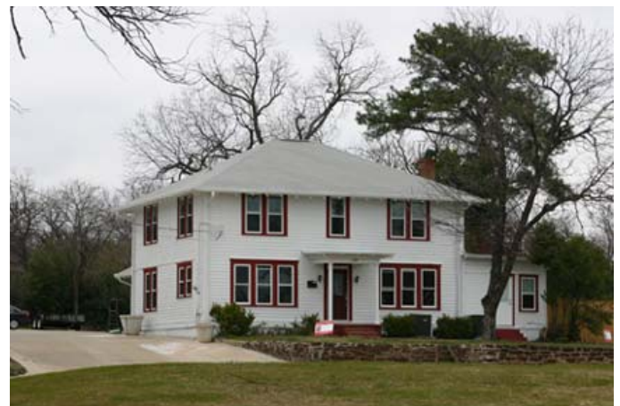
Shambhala Wellness Center, Denton

This presentation is intended to make us aware of these factors, and to develop a strategy to deal with them so that we can make smart choices. To make these choices, it is often recommended to get help to reduce your stress, get energized, to develop a nutritional plan and get back in shape through stretching, yoga and meditation. These techniques are explained to allow everyone to make the choice to age gracefully!